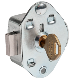
1770 DEAD BOLT