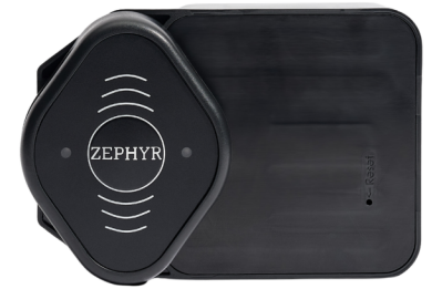
2500 ELECTRONIC RFID LOCK