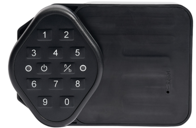
2600 ELECTRONIC KEYPAD LOCK