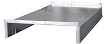
Open Base 4" High